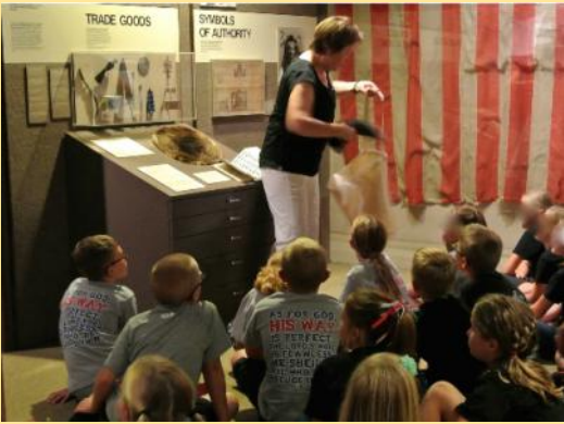
The Nebraska History Museum’s last school group tour before closing for renovation, August 2014.