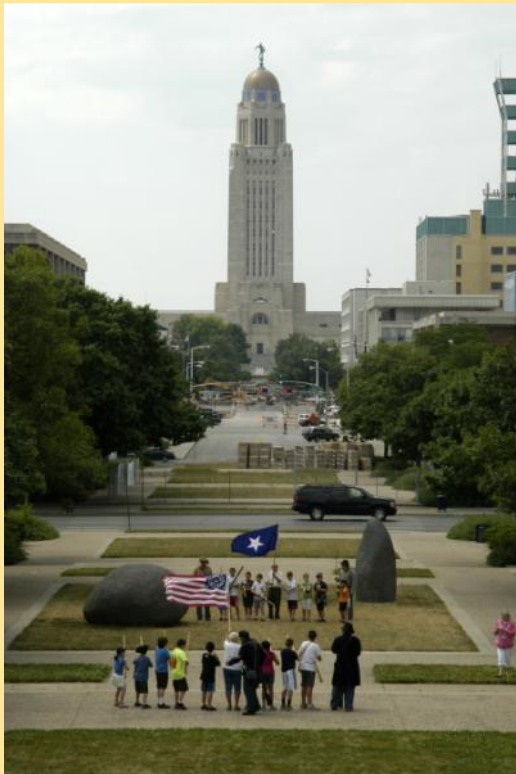
The Battle of Centennial Mall. Civil War reenactors teach kids battlefield maneuvers on June 14, 2012, as part of a Nebraska History Museum event.