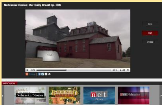
NET featured Neligh Mill State Historic Site in its " Nebraska Stories " series.