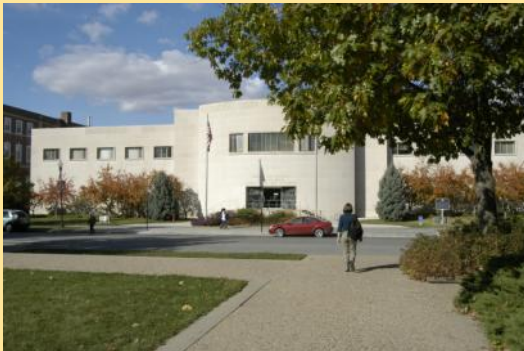
NSHS Headquarters, 1500 R Street, Lincoln.