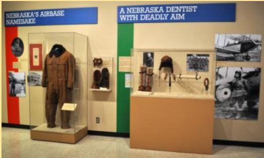
World War I artifacts from Pioneering Aviators from Flyover Country at the Nebraska History Museum.