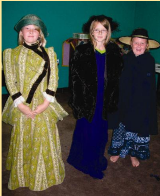
Several young students dressed in Victorian costumes for a 2011 summer class at the Nebraska History Museum.