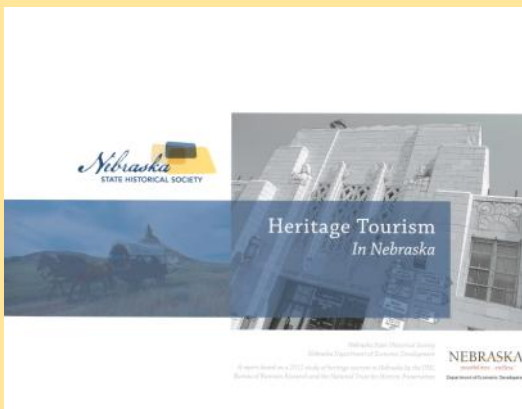
Heritage Tourism in Nebraska , a new report commissioned by the State Historic Preservation Office, found that visitation to historic sites in Nebraska generates over $196 million a year.