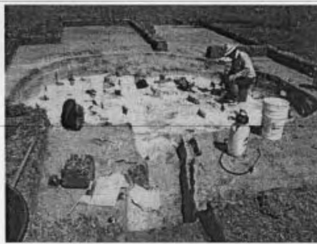
25SM20—View of House 6.

Two Central Plains Houses Excavated at Sherman Reservoir During the summer 2003, the Nebraska Archaeological Resources—Survey and Research Program at the University of Nebraska State Museum completed a 10-week excavation project on a small prehistoric hamlet on Sherman Reservoir near Loup City, Nebraska.