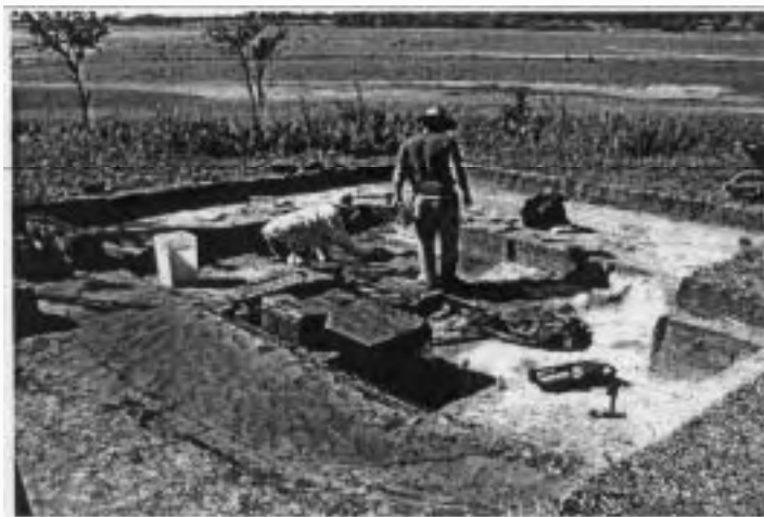
25SM20—View of House 6 excavation

Given these dates, it is possible that the inhabi-