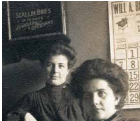
A detail provides two clues: the name of a local jeweler and optician, and a 1909 wall calendar showing either March or November, based on the configuration of visible dates.

Because this turned out not to be a Nebraska photo, I'm not planning any further research, but don't let web research be the end of your story. If you don't find your Nebraska topic in our website index, contact us directly and ask about it specifically. Include what you have located (and where you found the information!) and we will check our guides, catalogs, inventories, etc., to advise you if we have rel-