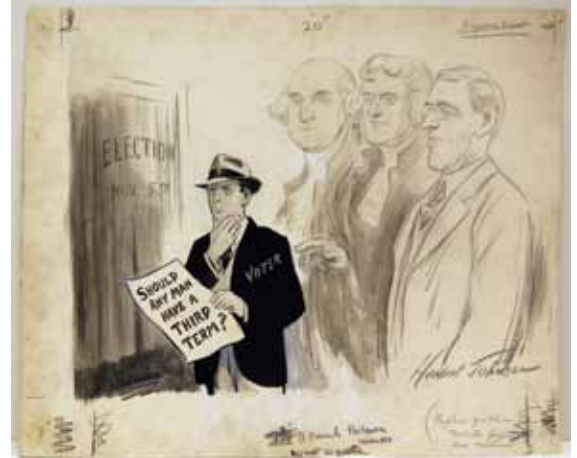
Though there was no presidential term limit in 1940, President Franklin Roosevelt's run for a third term was unprecedented.

"I try to think of all the things that should be said. The best of these I sketch rapidly on a sheet of scratch