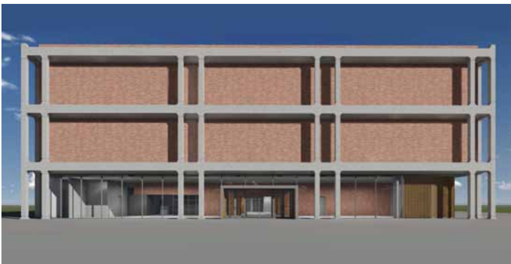
Architectural rendition of the Nebraska History Museum's new front entrance.