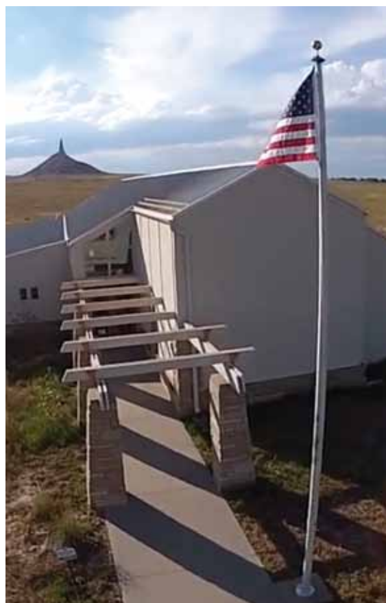
The Ethel S. and Christopher J. Abbott Visitor Center, See nebraskahistory.org/sites/rock

Count yourself among those numbers by attending the twentieth birthday party for the visitor center at Chimney Rock National Historic Site, 1.5 miles south of Highway 92 on Chimney Rock Road. A day's worth of events will be open to the public free of charge Saturday, July 19, from 9:30 a.m. to 4:30 p.m. Horse and wagon rides, first-person historical presentations, Oregon Trail talks, crafts to make and take, music, and more will be offered by the NSHS with additional support from Humanities NEBRASKA and the Nebraska State Historical Society Foundation. For more information visit nebraskahistory.org/sites/rock , or call 1-800-833-6747 or 308-586-2581. 📍