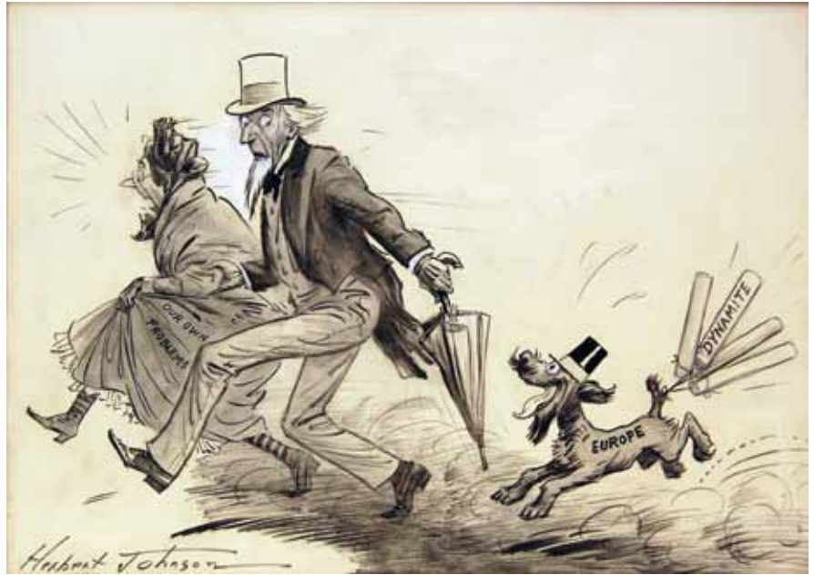
Until the Japanese attack on Pearl Harbor, The Saturday Evening Post opposed U.S. entry into World War II and favored an isolationist foreign policy.