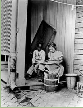
Two children on a back porch with a hand-cranked ice cream freezer.

Unless otherwise noted, all events are free and open to the public.