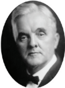
George W. Norris

The Nebraska Hall of Fame Commission, which has members appointed by the governor, names people to the Hall of Fame. 53 Until 1996, the commission named one person every two years, except when two people were named in the first two years of the Hall of Fame's existence, and four people were selected in 1976 in honor of the nation's bicentennial. Legislation passed in 1998 provides that no more than one person can be added to the Hall of Fame every five years. The 1998 legislation also provides that no person can be considered for the Hall of Fame until at least 35 years after his or her death. Busts of Hall of Fame members are displayed in the State Capitol and in other commission-approved locations.