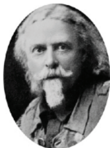
William Frederick Cody

Edward J. Flanagan (1886-1948) , founder of Father Flanagan's Boys Home, Boys Town. "I have never found a boy who really wanted to be bad." Lived in Omaha and Boys Town. Inducted into Hall of Fame 1965-66.