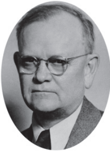
Hartley Burr Alexander

Hartley Burr Alexander (1873-1939) , anthropologist, poet, philosopher, educator and authority on North American Indian mythology. Best known as author of the symbolism and inscriptions on the Nebraska State Capitol and other buildings across the United States. Born in Lincoln; raised in Syracuse; lived in Lincoln. Inducted into Hall of Fame 1989-90.