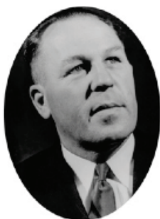
Dwight Palmer Griswold

Dwight Palmer Griswold (1893-1954) , banker, publisher, Nebraska governor 1941-47, U.S. senator 1953-54, chief of the American mission for aid to Greece 1947-48. Born in Harrison; raised in Gordon. Inducted into Hall of Fame 1993-94.