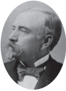
J. Sterling Morton

J. Sterling Morton (1832-1902) , father of Arbor Day, U.S. secretary of agriculture, editor, farmer, legislator and Nebraska territorial secretary. “Other holidays repose upon the past. Arbor Day proposes for the future.” Lived in Nebraska City. Inducted into Hall of Fame 1975-76.