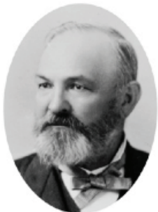
Robert W. Furnas

Robert W. Furnas (1824-1905) , newspaperman, soldier, historian, Nebraska governor 1873-75 and agriculturist. Lived in Brownville. Inducted into Hall of Fame 1979-80.