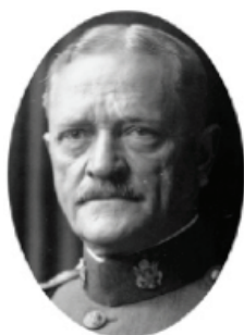
John J. Pershing

John J. Pershing (1860-1949) , soldier. Commandant of cadets, University of Nebraska, 1891-95; founder, Pershing Rifles; service, Indian Wars, Cuba, Philippines; commander, Mexican Border, 1916; commander, American Expeditionary Forces, France, 1917-19; general, Armies of the United States, 1919; and Army chief of staff, 1921-24. Lived in Lincoln. Inducted into Hall of Fame 1963-64.