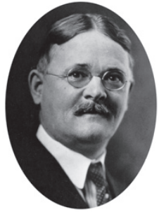
Nathan Roscoe Pound

Nathan Roscoe Pound (1870-1964) , botanist, pioneer ecologist, dean of University of Nebraska Law College and dean of Harvard Law School. Born and raised in Lincoln. Inducted into Hall of Fame 1975-76.