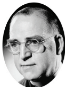
Edward J. Flanagan

John J. Pershing (1860-1949) , soldier. Commandant of cadets, University of Nebraska, 1891-95; founder, Pershing Rifles; service, Indian Wars, Cuba, Philippines; commander, Mexican Border, 1916; commander, American Expeditionary Forces, France, 1917-19; general, Armies of the United States, 1919; and Army chief of staff, 1921-24. Lived in Lincoln. Inducted into Hall of Fame 1963-64.