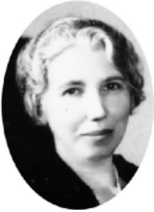
Bess Streeter Aldrich

Bess Streeter Aldrich (1881-1954) , author. Aldrich, narrator of Nebraska, gave literary life to Nebraska pioneer memories and honored the trials and dreams of settlers, that all may realize and cherish their heritage. One Aldrich novel, A Lantern in her Hand , was translated into many languages. Lived in Elmwood and Lincoln. Inducted into Hall of Fame 1971-72.