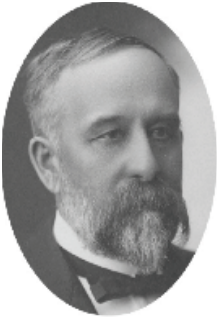
Charles E. Bessey

Charles E. Bessey (1845-1915) , nationally known University of Nebraska professor of botany and horticulture, 1884-1915, and author of federal legislation establishing agricultural experimentation stations at land-grant universities. Bessey's experiments with tree planting in the Nebraska Sandhills, and his tireless promotion of the idea, led to the establishment of the man-made Nebraska National Forest by President Theodore Roosevelt in 1902. Inducted into Hall of Fame 2007.