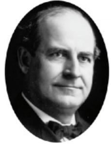
William Jennings Bryan

William Jennings Bryan (1860-1925) , three-time Democratic Party nominee for president of the United States, U.S. congressman, U.S. secretary of state, orator, religious leader and author. Lived in Lincoln. Inducted into Hall of Fame 1969-70.