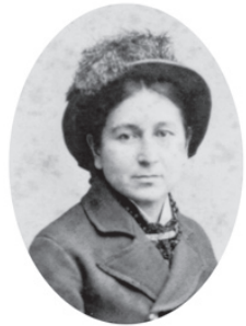
Susette LaFlesche Tibbles

Edward Creighton (1820-74) , telegraph pioneer and banker. Lived in Omaha. Inducted into Hall of Fame 1981-82.