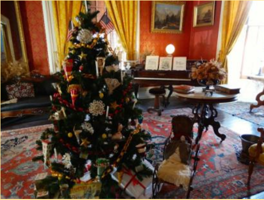
Victorian Holidays at the Thomas P. Kennard House in Lincoln.