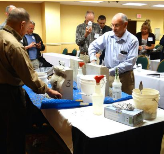
Preservation: Plain & Simple , a historic preservation conference held May 1, 2015, included hands-on instruction in practical skills.