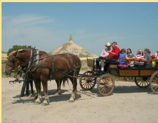
Celebrating the twentieth anniversary of the opening of the Ethel and Christopher J. Abbott Visitor Center at Chimney Rock National Historic Site, July 2014.