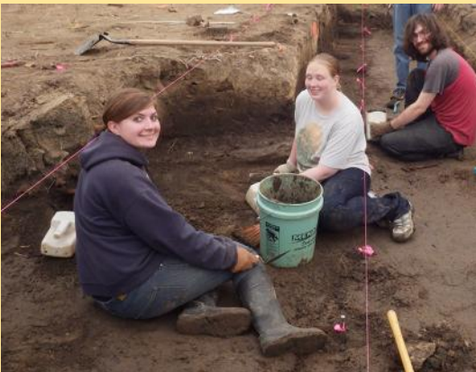
Students from the University of Nebraska-Lincoln archeological field school restore the Engineer Cantonment site from 2011 flood damage.