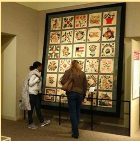
Homefront & Battlefield: Quilts & Context in the Civil War , co-sponsored by the NSHS and the Great Plains Art Museum, February 3 - June 27, 2015. The exhibit is one example of the NSHS's "Museum on the Move" programming.