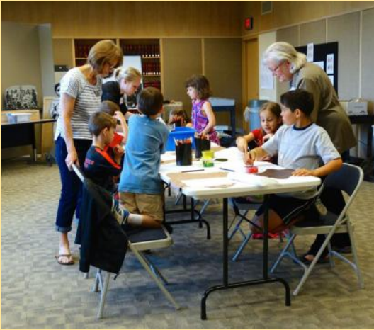
With the museum not available, NHM staff continued hosting classes at the NSHS headquarters building at 1500 R Street.