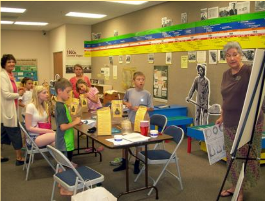
Kids' classes at the Nebraska History Museum.