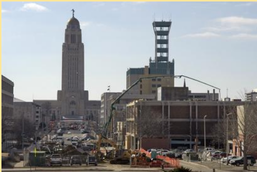
Nebraska History Museum renovation (plus Centennial Mall construction) in February 2015. The museum re-opens in 2016.