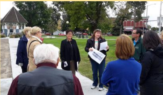
The Nebraska State Historic Preservation Board tours downtown Broken Bow, September 12, 2014.