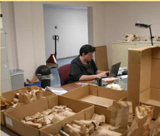
The archeology division has been in temporary office space this year; it will move to a new permanent location in late 2015.