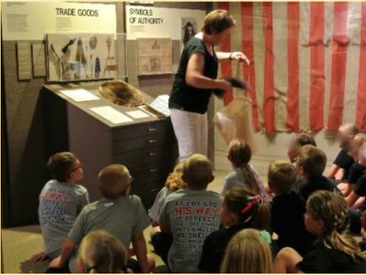
The Nebraska History Museum's last school group tour before closing for renovation, August 2014.