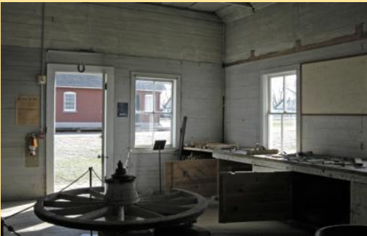
The wheelwright shop at Fort Robinson, virtually untouched since the 1940s, is now open to the public.

As major renovation work on P Street continues beside the museum, the museum itself prepared to close for its own $8 million renovation. Sinclair Hille Architects, Alley Poyner Macchietto Architecture, and Morrissey Engineering are planning a major renovation of the NHM, which will include replacing old and failing systems (HVAC, elevators, lighting, security, data, electrical and plumbing), insulating and providing vapor barriers on exterior walls, and upgrades to meet current fire, safety, and disability codes.