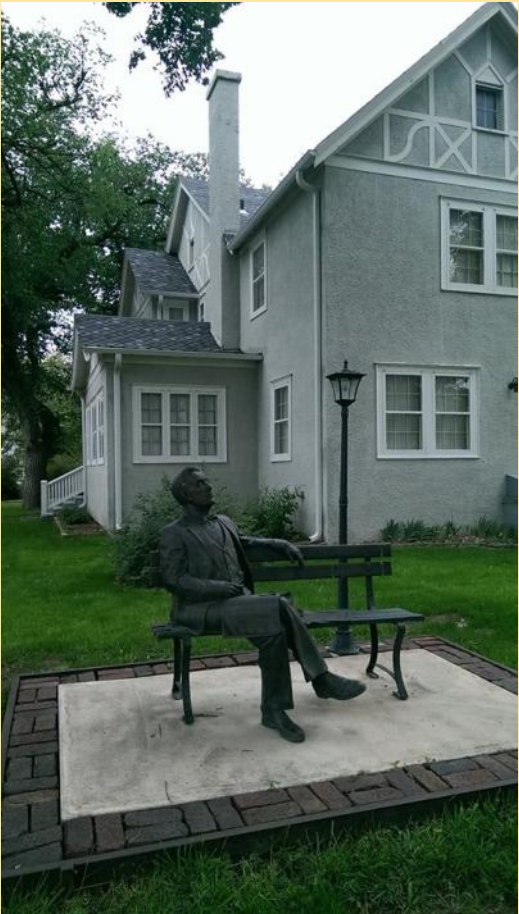
The Senator George W. Norris State Historic Site in McCook.