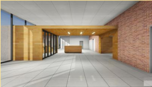
Architectural rendering of the new entrance to the Nebraska History Museum in Lincoln. The museum closed for renovation in August 2014.