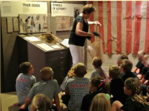
The Nebraska History Museum’s last school group tour before closing for renovation, August 2014.