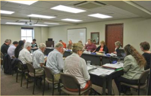
The NSHS Board of Trustees meeting in McCook, July 18, 2014.