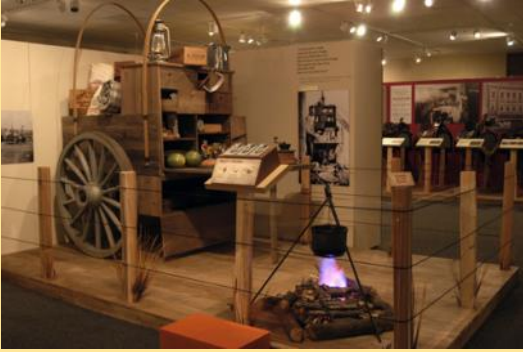
Chuck wagon display from the NHM's Nebraska Cowboys exhibit.