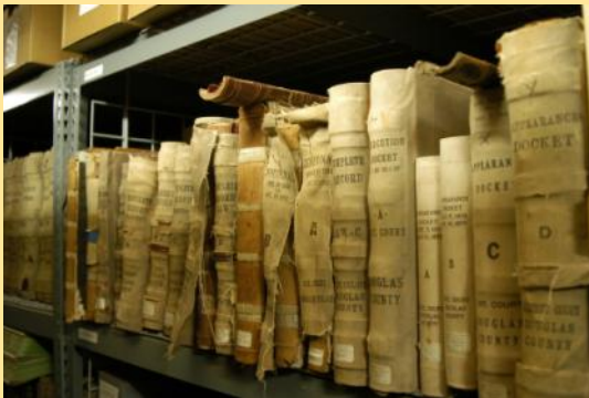
Nebraska Territory court records, some of the fragile documents housed at the NSHS's K Street Government Records facility.