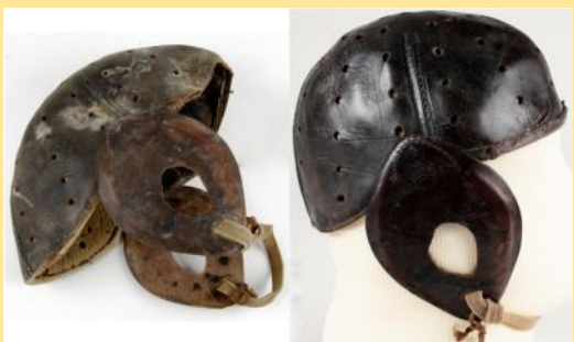
A 1912 University of Nebraska football helmet before and after treatment by Ford Center conservators.