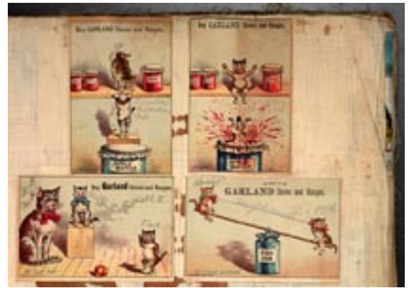
Willa Cather's childhood scrapbook is part of the Museum of Nebraska History's current "Saving Memories" exhibit.

"All these buildings are symbols of our democratic, representative, popularly-elected government."