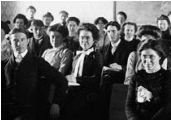
Shorthand class at Broken Bow Business College, 1903. RG2608:2816